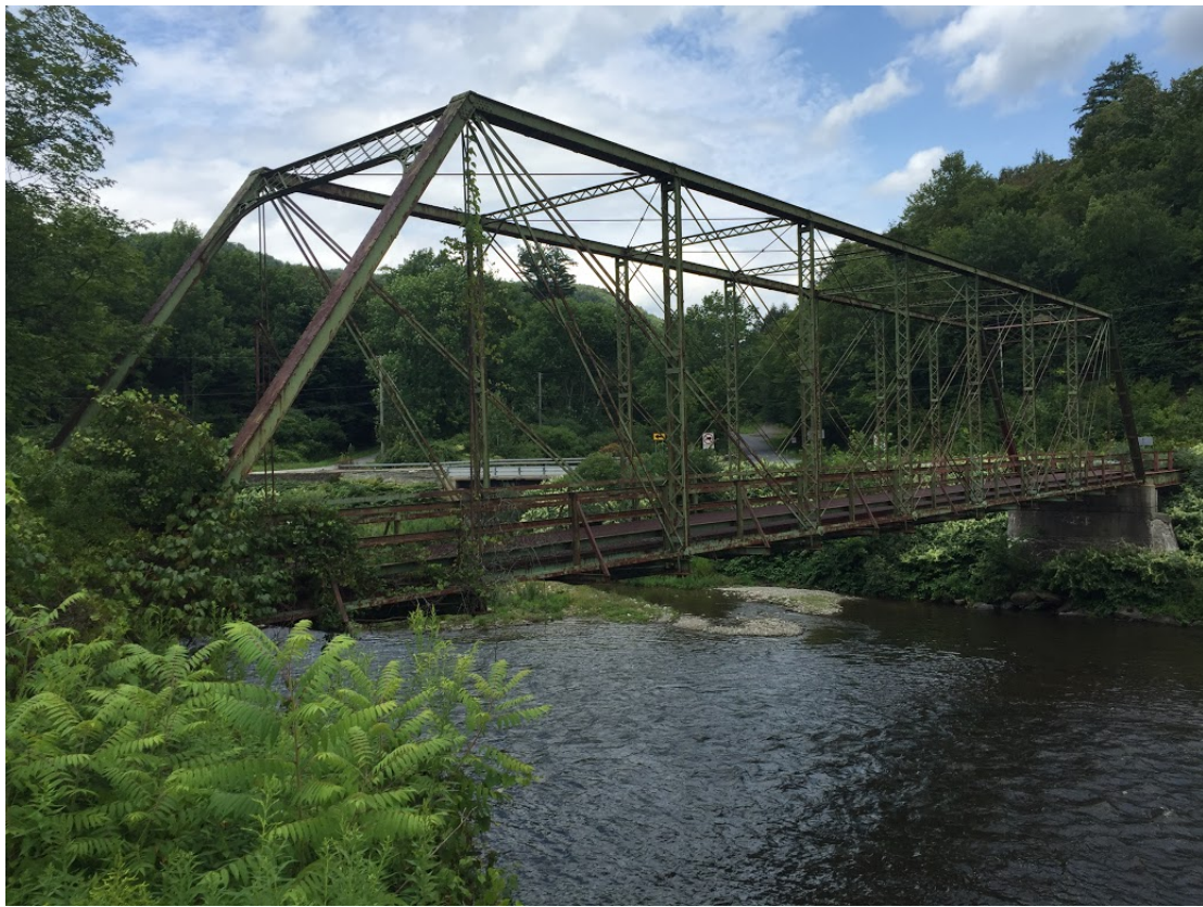
Scenic Bridge over Beaverkill – perfect for your Instapics 😊